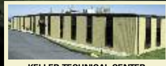
KELLER TECHNICAL CENTER