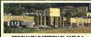
SPECIALTY BATTERY PLANT S-1