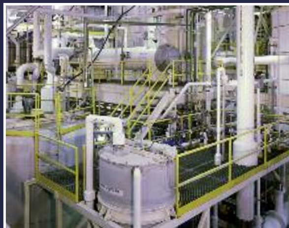
Wastewater Treatment Plant

The company's modern facilities as well as its long-standing "green" culture has made East Penn the most environmentally conscious proactive battery manufacturer and recycler in the world.