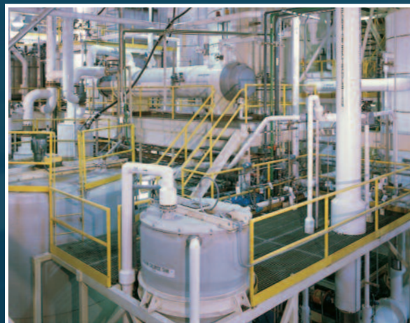
Wastewater Treatment Plant

The company's modern facilities as well as its long-standing "green" culture has made East Penn the most environmentally conscious proactive battery manufacturer, and recycler in the world.