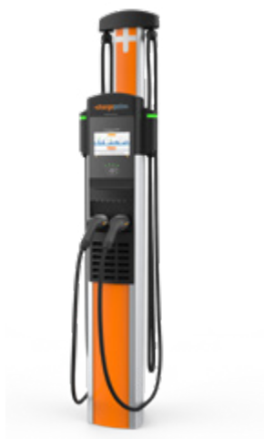
CP6321B-32A-L5.5 Pedestal mount, dual port, integrated 5.5 m cable