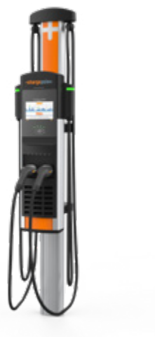
CP6323B-32A-L5.5 Wall mount, dual port, integrated 5.5 m cable