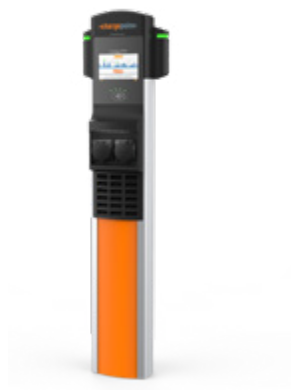
CP6121B-32A Pedestal mount, dual port, socket