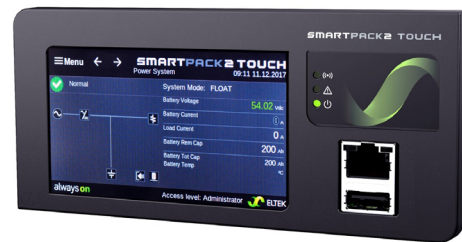
Smartpack2 Touch Controller