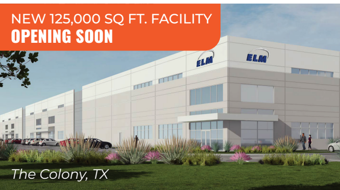
The Colony, TX

NEW 125,000 SQ. FT. FACILITY OPENING SOON