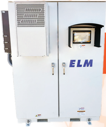
CMG15 & CMG30