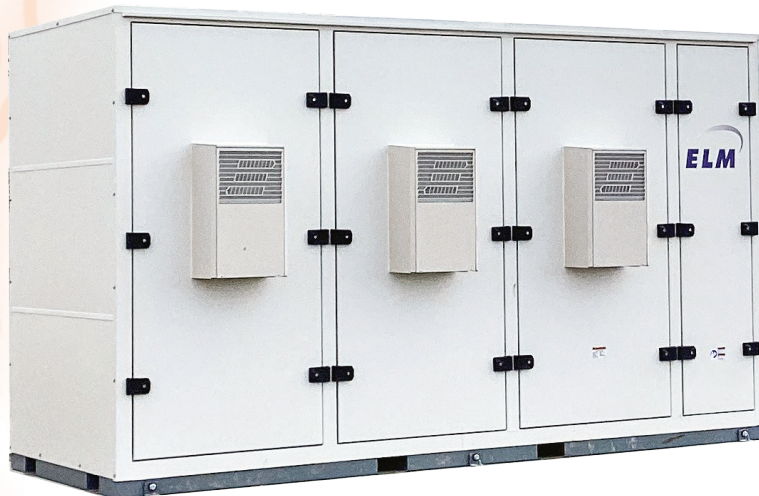
MG500 & MG1000