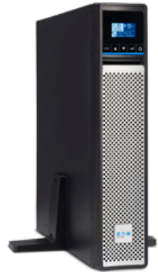
Tower: 1000–3000 VA