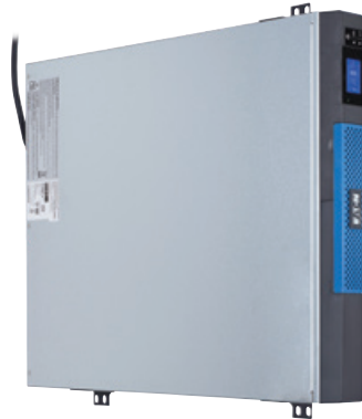
Wallmount: 5P 1500/1550 VA