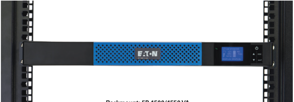
Rackmount: 5P 1500/1550 VA