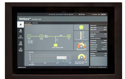
Intuitive local touchscreen display

The NetSure 8200 Series offers versatile solutions to meet the needs of your central office, mobile switching office, cable headend, or data center deployment.