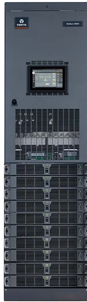
Combination Power and Distribution Bay

The NetSure™ 8200 Series offers compact combination bays, complementary distribution bays, and stand-alone power bays that integrate easily with existing AC infrastructure.