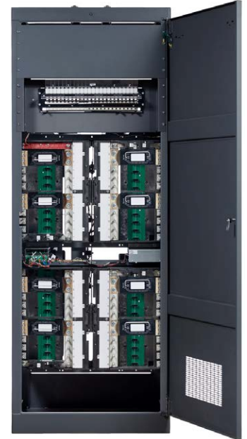
Distribution Only Bay