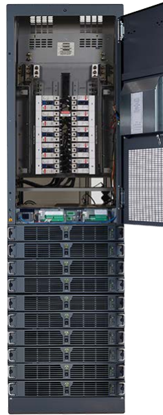
Power Only Bay