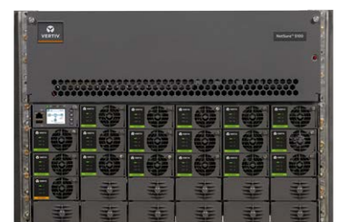
NetSure™ 5100 System, External Distribution 19.2 kW, 23" Rack (582137100)