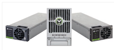
High-Efficiency eSure™ Rectifiers R48-3500e3 (left) R48-3500e (center) & R48-2000e3 (right)

The NetSure 7100 system is ideal for wireless, and wireline applications, including cell sites, MTSOs, small COs, datacenters, co-locations, huts, vaults and enclosures.